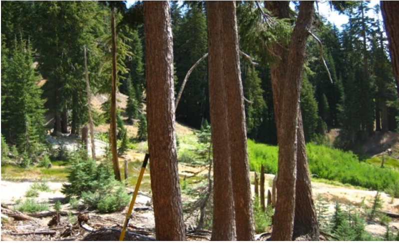
Figure 3. Relative stability-scattered mixed conifers

This site has the potential to develop patches of open California red fir-mixed conifer forest. Within the patches canopy cover may be up to 35 percent, but across the slope canopy cover is low, 5 to 25 percent. The debris flow material and the scarp face develop at different paces. The debris flow deposits, when stable, can develop tree patches earlier than the scarp face. The scarp face has shallower soils on steep exposed slopes, lose water quickly to drainage and evaporation. Mountain hemlock is common at the upper elevations of the site, while California red-fir and western white pine are more common at the lower elevations of this site.