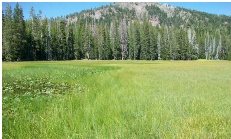
Figure 3. Frigid Lacustrine Flats