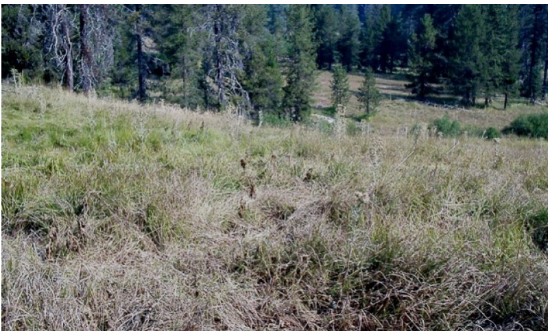
Figure 3. Thermal Seeps