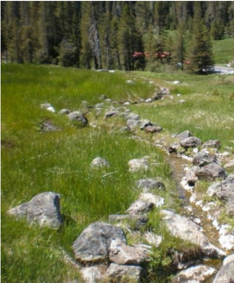
Figure 4. Altered Hydrology