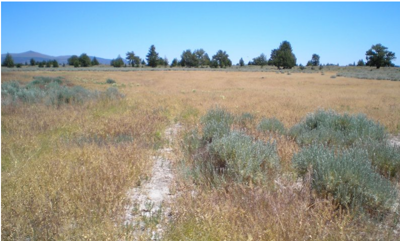
Figure 5. Community Phase 3.3

Community phase 3.1 is dominated by a silver sagebrush overstory. Nevada bluegrass and creeping wildrye are present in the understory, but at reduced amounts compared to the reference community. Dryland sedges, mat muhly, rushes, bottlebrush squirreltail, bluegrasses, and forbs also occur on this site, but in reduced amounts compared to the reference community. Native increasers (e.g. povertyweed and evening primrose) have increased, and are now common throughout the site. Non-natives on site are stable to increasing. Bare ground is high and vesicular crusts are becoming more prevalent on site.