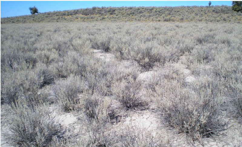
Figure 4. Community Phase 3.