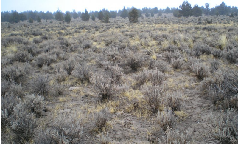
Figure 3. Community Phase 3.1