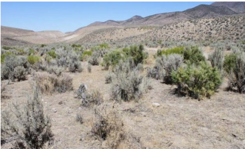
Figure 13. Dry Floodplain Community Phase 3.1 NV775 MU1031 Teman Soil T. Stringham August 2010

Decadent basin big sagebrush dominates the overstory. Black greasewood and rabbitbrush may be significant components of the shrub overstory. Trace amounts of perennial grasses may or may not be present. Annual species dominate the understory. Bare ground is increasing throughout the community. Spatial and temporal energy capture and nutrient cycling has been altered. Hydrological processes, like infiltration, may be inhibited due to a lack of ground cover.