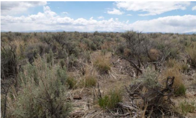
Figure 10. Plant community 3.2a