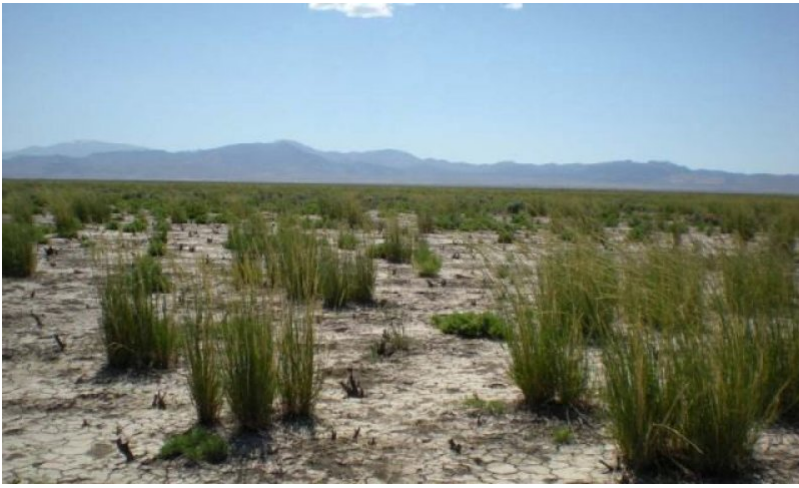
Figure 9. 24-06 Dry Floodplain Phase 2.2 T. Stringham Summer 2010

Perennial bunchgrasses, especially basin wildrye, respond positively to fire. Annual species, like cheatgrass and Russian thistle, are present and typically increase following wildfire due to increased resource availability. Rabbitbrush and spiny hopsage may be resprout 1-2 years following fire.