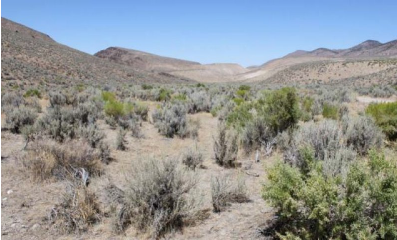
Figure 12. Dry Floodplain Community Phase 3.1 NV775 MU1031 Teman Soil T. Stringham August 2010