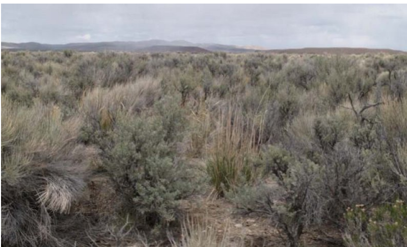
Figure 11. Plant community 3.2b

Perennial grasses decline and the shrubs dominate. Annual weedy species are stable or increasing within the understory. Inland saltgrass may be increasing. This community phase is at risk of crossing a threshold into state 3 or 4. Prevent a transition to a less desirable state by using prescribed grazing and encouraging low intensity fires (depending on the invasive annual understory species). Basin wildrye is a very resilient plant and will increase given the opportunity. Dormant season grazing by livestock may reduce brush cover and favor an increase in basin