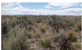
Community Phase (at risk)