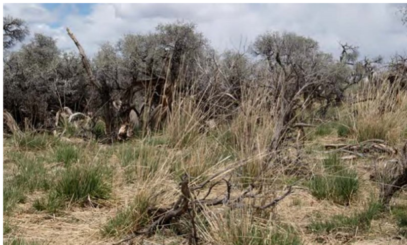
Figure 8. Dry Floodplain Community Phase 2.1 NV777 MU732 Kelk Soil T. Stringham April 2010

This community is dominated by basin wildrye. Basin big sagebrush is common. This community is compositionally similar Community Phase 1.1 with a trace of weedy annual species like cheatgrass and Russian thistle.