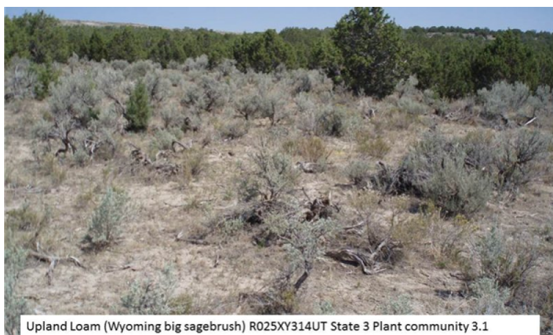
Figure 7. Photo State 3 Plant Community3.1

This community has a strong overstory of Utah Juniper and Singleleaf pinyon but still has an understory similar to community 2.1. This community will have around 20 – 35% bare ground. Fire is the surest means to bring this community back toward the Current potential State.