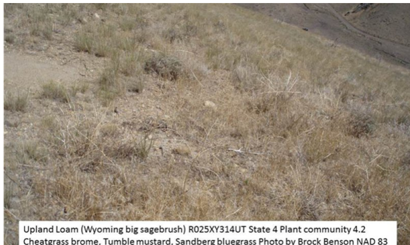
Upland Loam (Wyoming big sagebrush) R025XY314UT State 4 Plant community 4.2 Cheatgrass brome, Tumble mustard, Sandberg bluegrass NAD 83