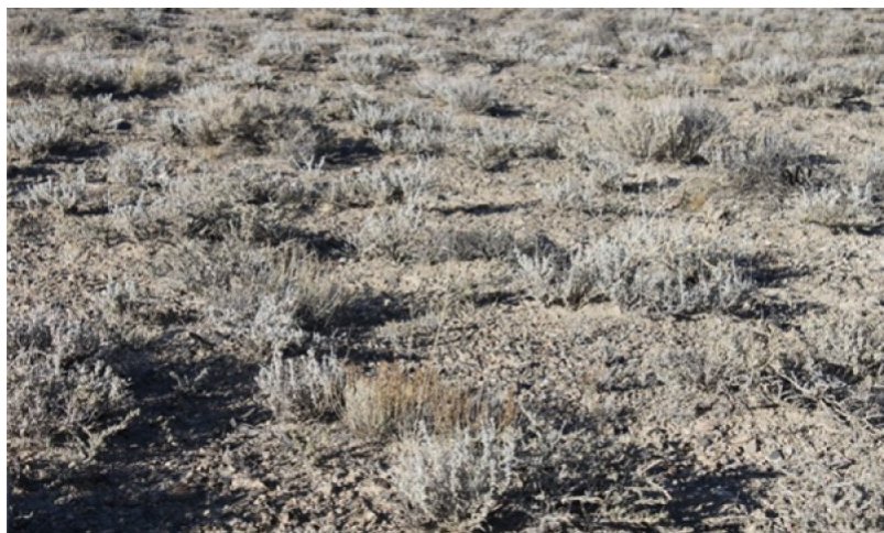
Figure 9. Coarse Silty 5-8", T.Stringham, May 2012, NV766 MU116