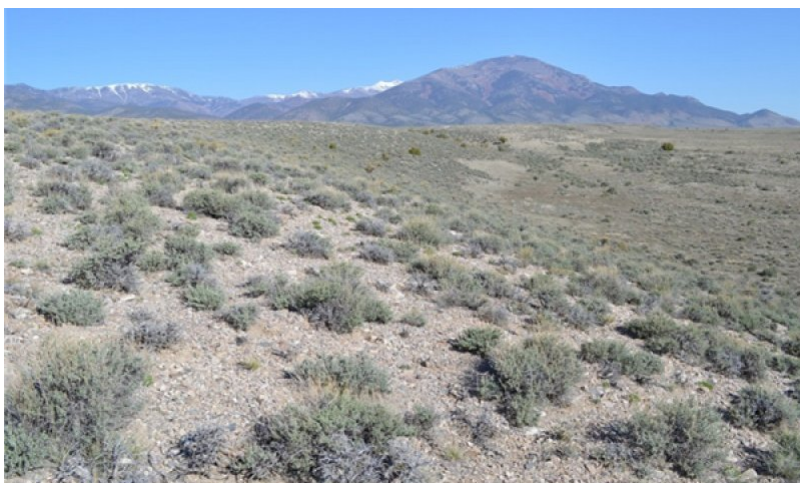
Figure 8. P. Novak-Echenique_4/2013

Black sagebrush dominates the overstory and perennial bunchgrasses in the understory are reduced, either from