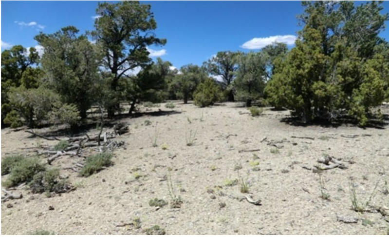
Figure 9. Tree Remova_P. Novak-Echenique_6/2013

Juniper trees dominate overstory, sagebrush is decadent and dying, deep rooted perennial bunchgrasses are decreasing. Recruitment of sagebrush cohorts is minimal. Annual non-natives may be present or increasing. Bare ground in interspaces are large and connected.