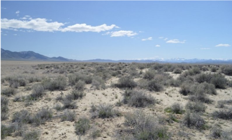
Figure 8. T.Stringham_4/24/2013, MU779_1390 Kawich soil series

Fourwing saltbush and other shrubs increase in the absence of disturbance. Excessive herbivory may cause an increase in black greasewood and other unpalatable shrubs. Fourwing saltbush and other shrubs dominate the overstory and the deep-rooted perennial bunchgrasses in the understory are reduced either from competition with shrubs and/or from herbivory.