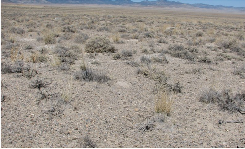
Figure 9. P.Novak-Echenique, 5/2012, NV766 MU 120

Shadscale and rabbitbrush increase while Indian ricegrass and bud sagebrush decline. Bare ground increases along with annual weeds (<5% by weight). Prolonged drought may lead to an overall decline in the plant community. Galleta grass may increase. Wet periods will decrease the shadscale component.