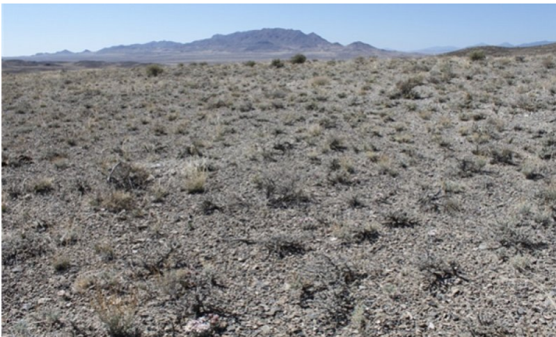
Figure 11. Loamy 5-8" , T. Stringham May 2012, NV766 MU 1510

Decadent shadscale and bud sagebrush dominate the overstory. Rabbitbrush and/or other sprouting shrubs may be a significant component or dominant shrub. Deep-rooted perennial bunchgrasses may be present in trace amounts or absent from the community. Annual non-native species increase. Bare ground is significant.