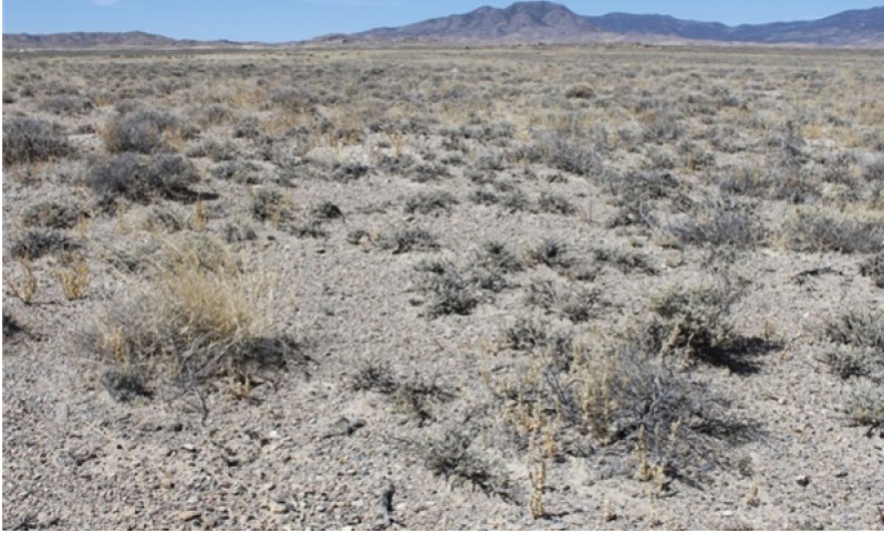
Figure 10. Loamy 5-8" , T. Stringham May 2012, NV766 MU 1510