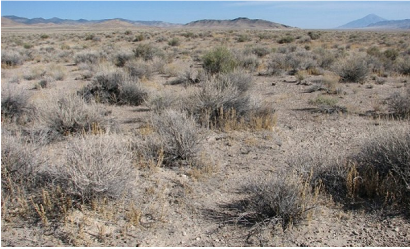
Figure 8. P Novak-Echenique 5/2012; NV766, MU1520

Decadent shadscale, horsebrush and bud sagebrush dominate the overstory. Rabbitbrush and/or other sprouting shrubs may be a significant component or dominant shrub. Deep-rooted perennial bunchgrasses may be present in trace amounts or absent from the community. Annual non-native species increase. Bare ground and wind erosion is significant.