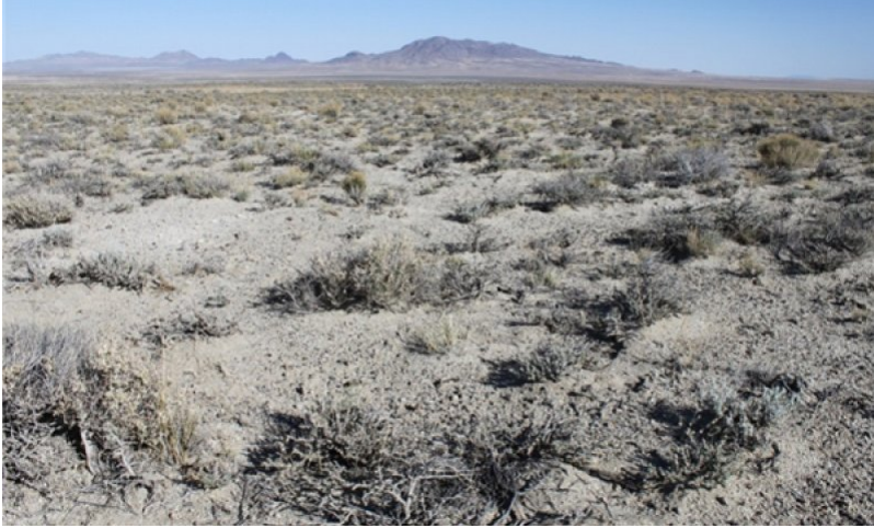
Figure 9. Coarse Gravelly Loam 5-8" (028AY018NV) T. Stringham May 2012

Decadent shadscale and bud sagebrush dominate the overstory. Rabbitbrush and/or other sprouting shrubs may be a significant component or dominant shrub. Deep-rooted perennial bunchgrasses may be present in trace amounts or absent from the community. Annual non-native species increase. Bare ground and wind erosion is significant.