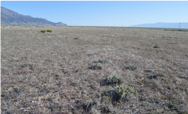
Figure 13. Coarse Gravelly Loam 5-8", T. Stringham 4/2013, NV779, MU 1354

This community is dominated by annual non-native species. Halogeton and cheatgrass most commonly invade these sites. Trace amounts of shadscale and other shrubs may be present, but are not contributing to site function. Bare ground and wind erosion may be significant, especially during low precipitation years. Wind erosion and excessive soil temperatures are driving factors in site function.