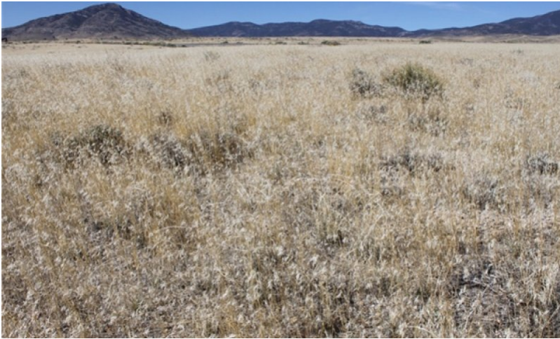
Figure 12. Coarse Gravelly Loam 5-8", T. Stringham 5/2012, NV766 MU1520