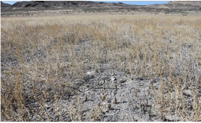
Figure 11. Coarse Gravelly Loam 5-8", T. Stringham 5/2012, NV766 MU120