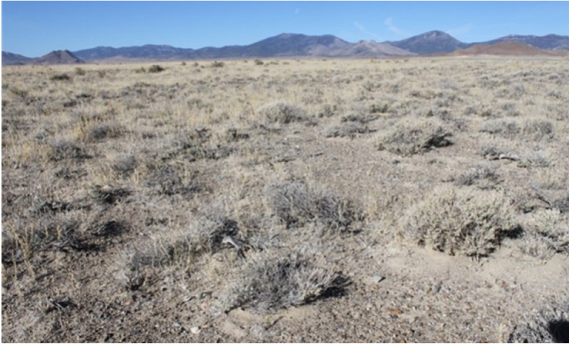
Figure 8. Coarse Gravelly Loam 5-8" (028AY018NV) T. Stringham May 2012

Shadscale and rabbitbrush increase while Indian ricegrass and bud sagebrush decline. Annual weeds may increase. Prolonged drought may lead to an overall decline in the plant community and increased soil erosion. Galleta grass may increase. Wet periods will decrease the shadscale component.