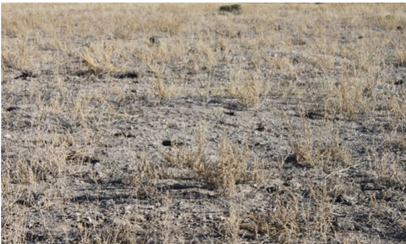
Figure 10. Coarse Gravelly Loam 5-8", T. Stringham 5/2012, NV766, MU116