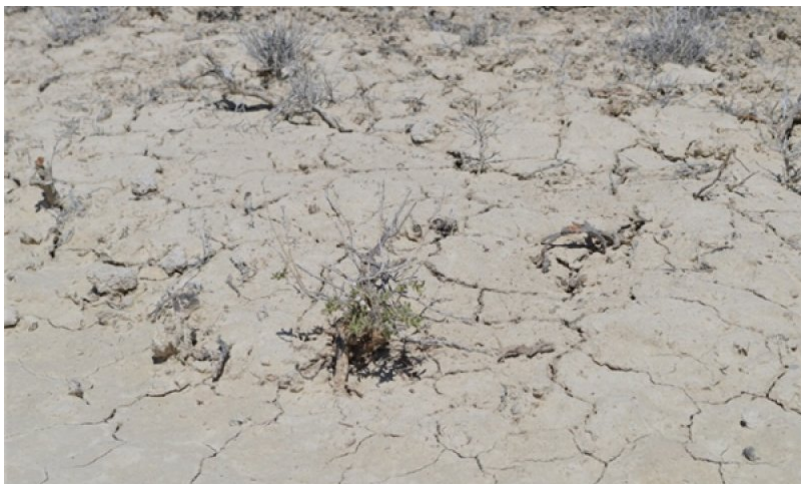
Figure 10. Alkali Silt Flat, T.Stringham April 2013, NV779, MU3271