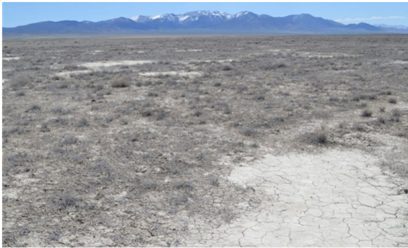
Figure 9. Alkali Silt Flat, T.Stringham April 2013, NV779 MU3271