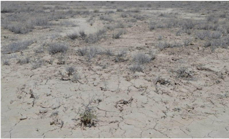
Figure 11. Alkali Silt Flat, T.Stringham April 2013, NV779 MU3271

Sickle saltbush and other shrubs may be the dominant species but are only present in patches, and are not contributing to site function. Regeneration of herbaceous species is not evident. Invasive plants (halogeton, Russian thistle) are sporadic and associated on mounds bordering playettes. Bare ground may be abundant, especially during low precipitation years. Wind erosion and extreme soil temperatures are driving factors in site function.