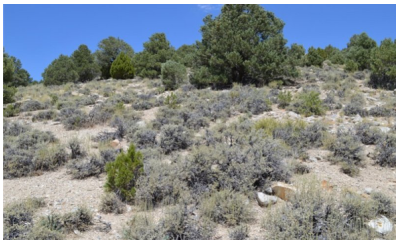
Figure 10. Shallow Calcareous Slope 10-14" (028AY034NV) T. Stringham August 2013

Decadent black sagebrush dominates the overstory. Rabbitbrush may be a significant component. Deep-rooted perennial bunchgrasses may be present in trace amounts or absent from the community. Sandberg bluegrass and annual non-native species increase. Galleta grass may be present. Bare ground is significant and soil redistribution may be occurring. If present on the site, Utah juniper and/or singleleaf pinyon is increasing. This community phase may be at risk of transitioning to either the Tree State or Annual State.