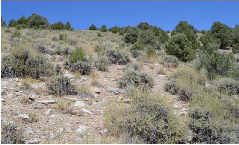
Figure 9. Shallow Calcareous Slope 10-14" (028AY034NV) T. Stringham August 2013

Black sagebrush dominates the overstory and perennial bunchgrasses in the understory are reduced, either from competition with shrubs or from inappropriate grazing, or from both. Rabbitbrush may be a significant component. Sandberg bluegrass may increase and become co-dominate with deep rooted bunchgrasses. Utah juniper and/or singleleaf pinyon may be present and without management will likely increase. Annual non-natives species may be stable or increasing due to lack of competition with perennial bunchgrasses. This site is susceptible to further degradation from grazing, drought, and fire. This community is at risk of crossing a threshold to either State 3.0 (grazing or fire) or State 4.0 (fire).