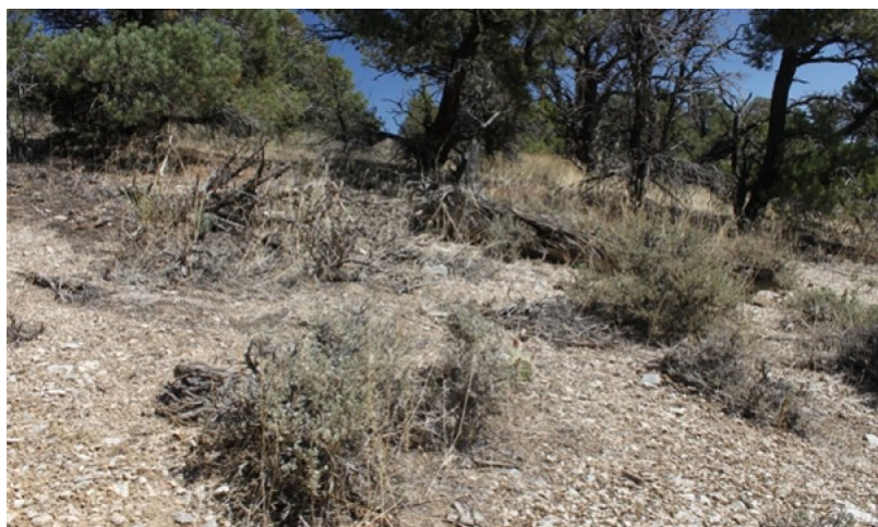
Figure 9. P. Novak-Echenique_7/2012

Juniper trees dominate overstory, sagebrush is decadent and dying, deep rooted perennial bunchgrasses are decreasing. Recruitment of sagebrush cohorts is minimal. Annual non-natives may be present or increasing. Bare ground in interspaces are large and connected.