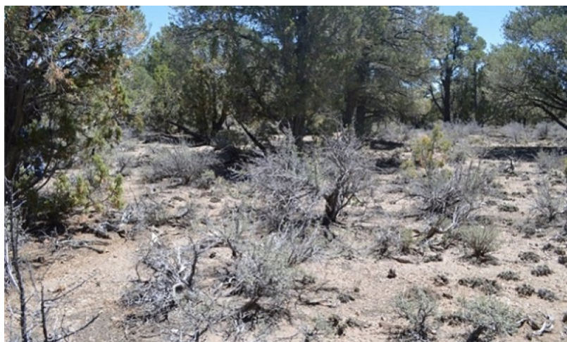
Figure 10. Shallow Clay Loam 12-14 (028AY036NV)

Utah juniper and/or singleleaf pinyon dominates the site and tree leader growth is minimal; annual non-native species may be the dominant understory species and will typically be found under the tree canopies. Trace amounts of sagebrush may be present however dead skeletons will be more numerous than living sagebrush. Bunchgrasses may or may not be present. Sandberg bluegrass or mat forming forbs may be present in trace amounts. Bare ground interspaces are large and connected. Soil redistribution is evident.