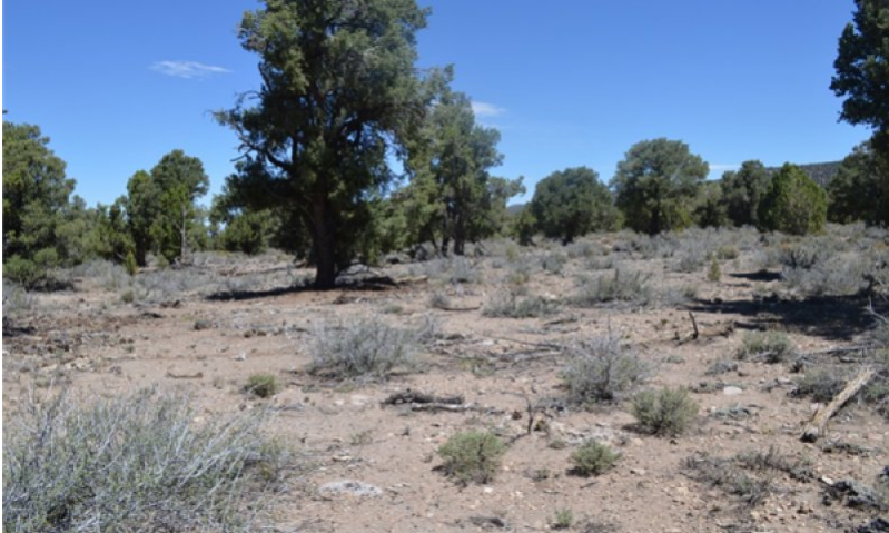
Figure 9. Shallow Clay Loam 12-14" (028AY036NV) T. Stringham July 2014

Decadent black sagebrush dominates the overstory. Rabbitbrush may be a significant component. Deep-rooted perennial bunchgrasses may be present in trace amounts or absent from the community. Sandberg bluegrass and annual non-native species increase. Galleta grass may be present. Bare ground is significant and soil redistribution may be occurring. If present on the site, Utah juniper and/or singleleaf pinyon is increasing. This community phase may be at risk of transitioning to either the Tree State or Annual State.