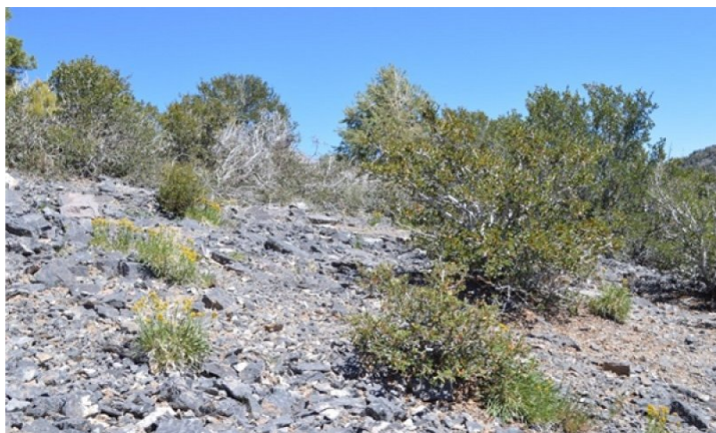
Figure 9. Stony Mahogany Savanna (R028AY058NV) T. Stringham July 2014

Curlleaf mountain mahogany dominates the overstory. Mountain big sagebrush, mountain snowberry, and rabbitbrush decrease. Perennial bunchgrass understory is reduced. Bare ground may be increasing. Muttongrass will likely increase in the understory and may be the dominant grass on the site. Mahogany may have a “hedged” or tree-like appearance from many years of browsing by deer. Annual non-native plants are increasing in the understory. Scattered pinyon trees may be present and increasing on the site, however the mahogany and shrub understory is intact and is dominating site resources (Miller et al 2008).