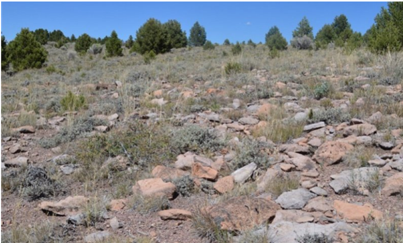
Figure 9. T. Stringham_7/2014

This community is at risk of crossing a threshold to another state. Sagebrush dominates the overstory and perennial bunchgrasses in the understory are reduced, either from competition with shrubs or from inappropriate grazing, or from both. Rabbitbrush may be a significant component. Sandberg bluegrass may increase and become co-dominant with deep rooted bunchgrasses. Singleleaf pinyon may be present and without management will likely increase. Annual non-natives species may be stable or increasing due to lack of competition with perennial bunchgrasses. This site is susceptible to further degradation from grazing, drought, and fire.