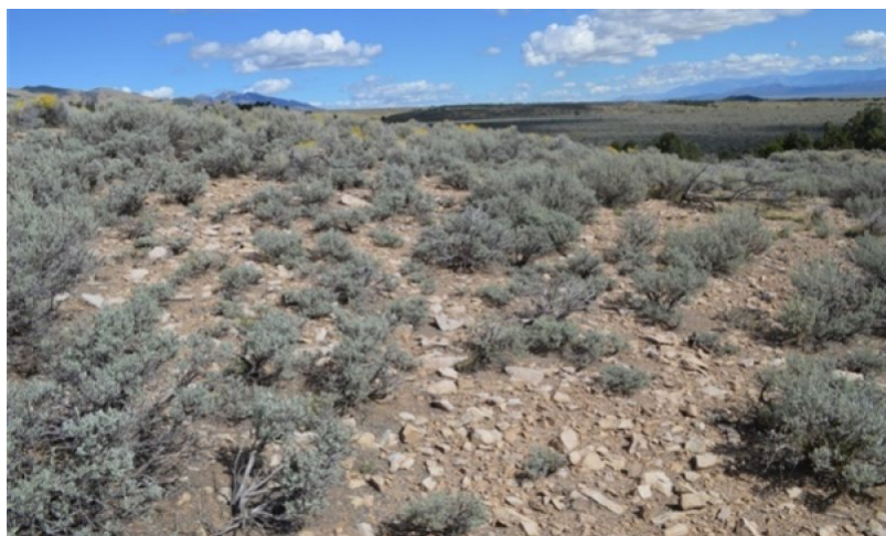
Figure 9. Shallow Loam 10-14" (R028AY064NV). T.Stringham, September 2014

This site is at risk of transitioning to another state. Mountain big sagebrush, possibly decadent, dominates overstory and rabbitbrush may be a significant component. Deep-rooted perennial bunchgrasses may be present in trace amounts or absent from the community. Sandberg bluegrass, squirreltail, and annual non-native species increase. Understory may be sparse, with bare ground increasing. Utah juniper or singleleaf pinyon may be present as a result lack of disturbance (wildfire).