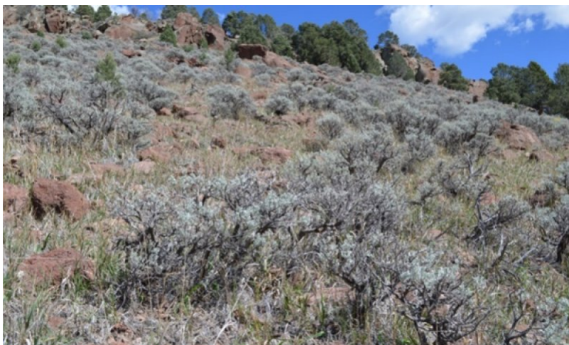
Figure 11. Shallow Loam 10-14" (R028AY064NV). T.Stringham, September 2014

Sprouting shrubs such as rabbitbrush and seeded species co-dominate. Annual non-native species stable to increasing. Sagebrush may be a minor component.