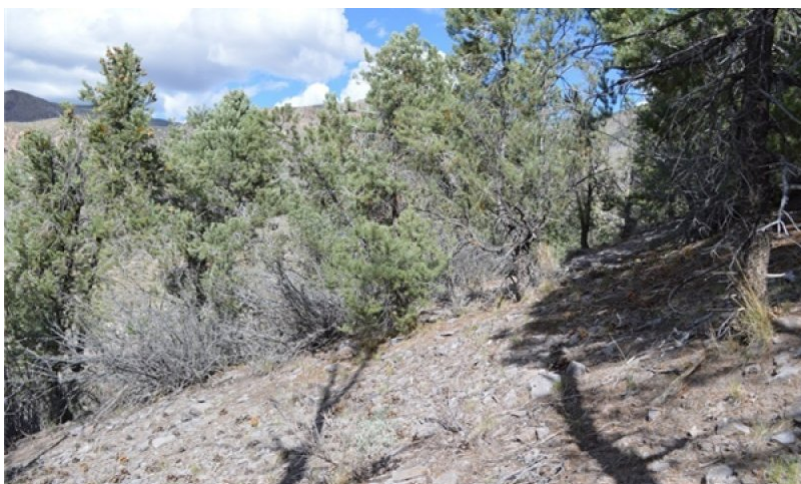
Figure 10. Shallow Loam 10-14" (R028AY064NV). T.Stringham, September 2014

Utah juniper and singleleaf pinyon dominate the site and tree leader growth is minimal; annual non-native species may be the dominant understory species and will typically be found under the tree canopies. Trace amounts of sagebrush may be present, however dead skeletons will be more numerous than living sagebrush. Deep-rooted bunchgrasses may or may not be present. Muttongrass, Sandberg bluegrass, or mat forming forbs may be present in trace amounts. Muttongrass may be more common in this phase as it is the most tolerant of shade. Bare ground areas are large and connected. Soil redistribution is excessive.