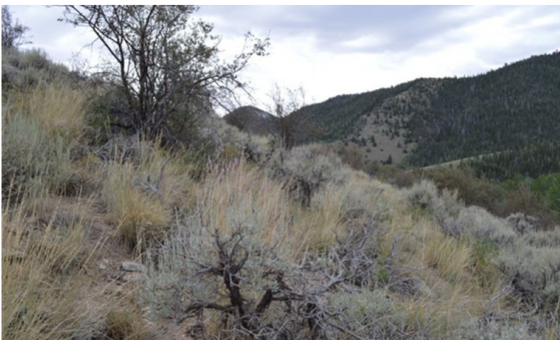
Figure 8. Shallow Loam 14+ (R028AY065NV) T. Stringham, August 2013

The plant community is dominated by bluebunch wheatgrass and mountain big sagebrush. Mountain snowberry is also common on this site. Potential vegetative composition is about 70% grasses, 10% forbs and 20% shrubs. Approximate ground cover (basal and crown) is 30 to 40 percent.