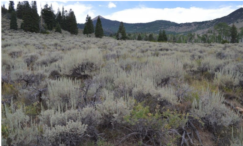
Figure 9. MU 5432 Shallow Loam 14+ (R028AY068NV). T.Stringham, August 2013

Mountain big sagebrush increases and the perennial understory is reduced. Decadent sagebrush dominates the overstory and the deep-rooted perennial bunchgrasses in the understory are reduced either from competition with shrubs or from grazing management. Perennial forbs such as mules-ear may increase with inappropriate herbivory. Non-natives are present.