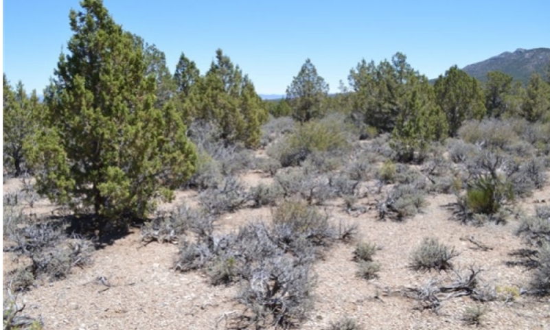
Figure 8. Calcareous Fan Piedmont (028AY087NV) T. Stringham July 2014

Decadent black sagebrush dominates the overstory. Rabbitbrush may be a significant component. Deep-rooted perennial bunchgrasses may be present in trace amounts or absent from the community. Sandberg bluegrass and annual non-native species increase. Bare ground is significant and soil redistribution may be occurring. If present on the site, Utah juniper and/or singleleaf pinyon is increasing. This community phase may be at risk of transitioning to either the Tree State or Annual State.