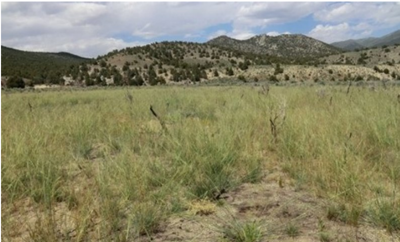
Figure 8. Loamy Fan 10-14" (028AY091NV) P. Novak-Echenique, June 2013.

Needle and thread dominates the site; annual non-native species may be present but are not dominant. Thickspike wheatgrass may be sub-dominant. Trace amounts of sagebrush or rabbitbrush may be present. Basin wildrye is present in trace amounts or is absent.