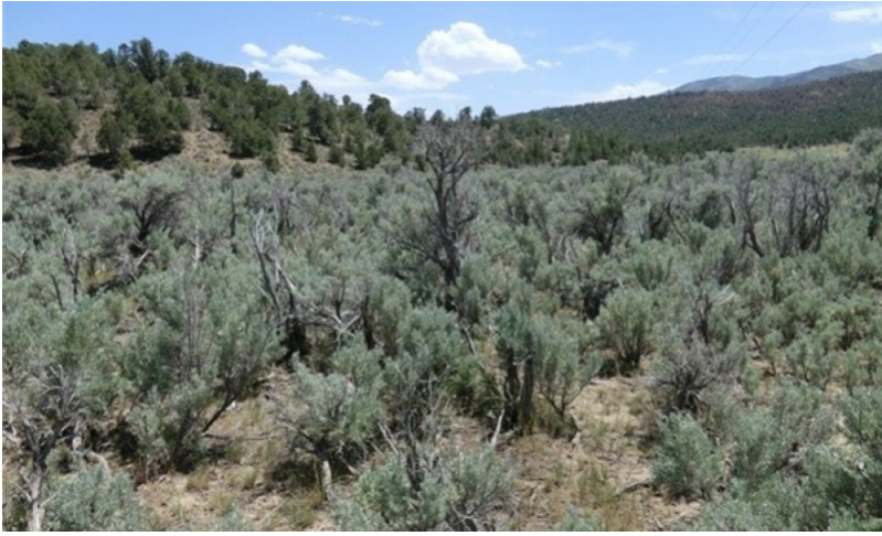
Figure 7. Loamy Fan 10-14" (028AY091NV) T.K. Stringham, June 2013.

Decadent big sagebrush dominates the overstory. Rabbitbrush may be significant components. Deep-rooted perennial bunchgrasses may be present in trace amounts or absent from the community. Annual non-native species increase. Crested wheatgrass may be a significant component in this phase if the site has a history of seeding treatments. Bare ground is significant.