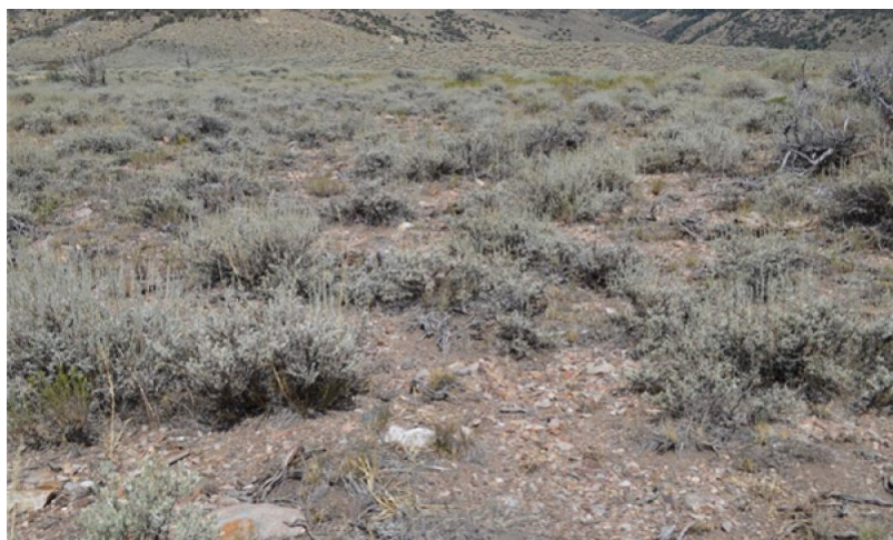
Figure 9. no tree invasion_T. Stringham_8/2013

Decadent sagebrush dominates the overstory. Rabbitbrush may be a significant component. Deep-rooted perennial bunchgrasses may be present in trace amounts or absent from the community. Sandberg bluegrass, muttongrass and annual non-native species increase. Bare ground is significant. Juniper and/or singleleaf pinyon may be present as a result of encroachment from neighboring sites and lack of disturbance.