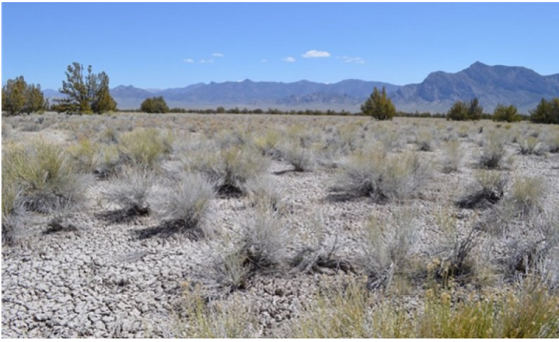
Figure 10. Saline Bottom, T. Stringham, April 2013, NV779 MU 3510

Rabbitbrush dominates the site. Perennial bunchgrasses are present but a minor component. Annual non-native species are present and may be increasing in the understory.