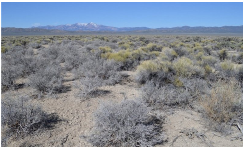
Figure 9. Saline Bottom , T. Stringham, April 2013, NV779 MU 3510