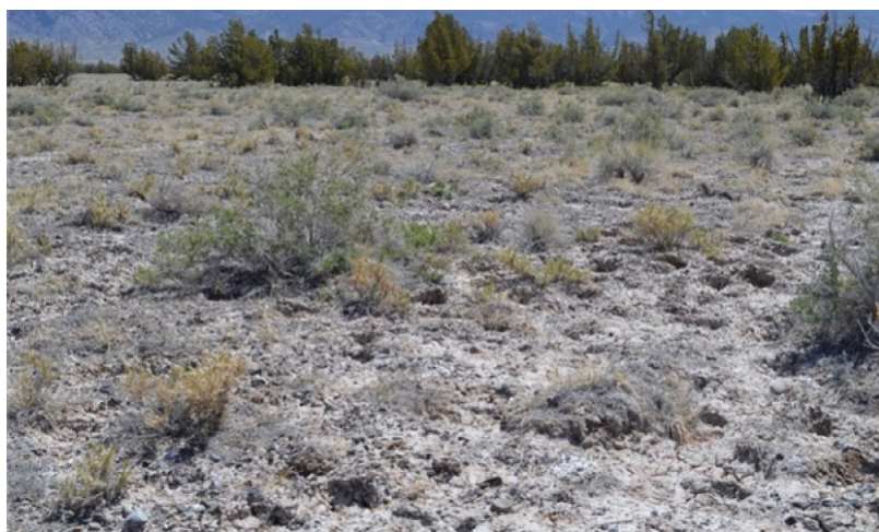
Figure 8. T. Stringham_4/2013; SS NV779, MU 3510

Black greasewood dominates the overstory and perennial bunchgrasses in the understory are reduced, either from competition with shrubs or from inappropriate grazing management, or from both. Rabbitbrush may be a significant component. Annual non-native species are stable or increasing. This community is at risk of crossing a threshold to State 3.0 (grazing or fire).