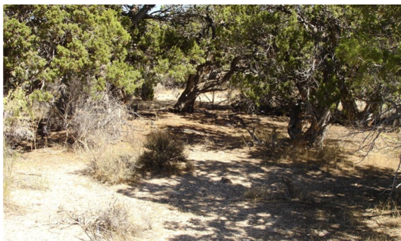
Figure 10. Community Phase 3.2, photo 1