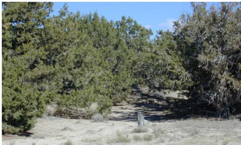
Figure 9. Community Phase 3.2, photo 2