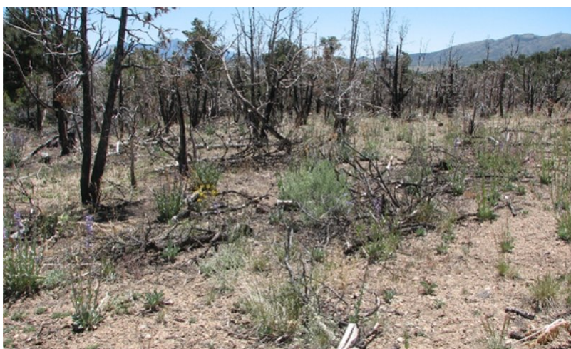
Figure 14. Prescribed Burn-2009; P.Novak-E, 6/12/2012, MU1260

Utah juniper and/or singleleaf pinyon dominates the site and tree leader growth is minimal; annual non-native species may be the dominant understory species and will typically be found under the tree canopies. Trace amounts of sagebrush may be present however dead skeletons will be more numerous than living sagebrush. Bunchgrasses may or may not be present. Sandberg bluegrass or mat forming forbs may be present in trace amounts. Bare ground interspaces are large and connected. Soil redistribution is evident.