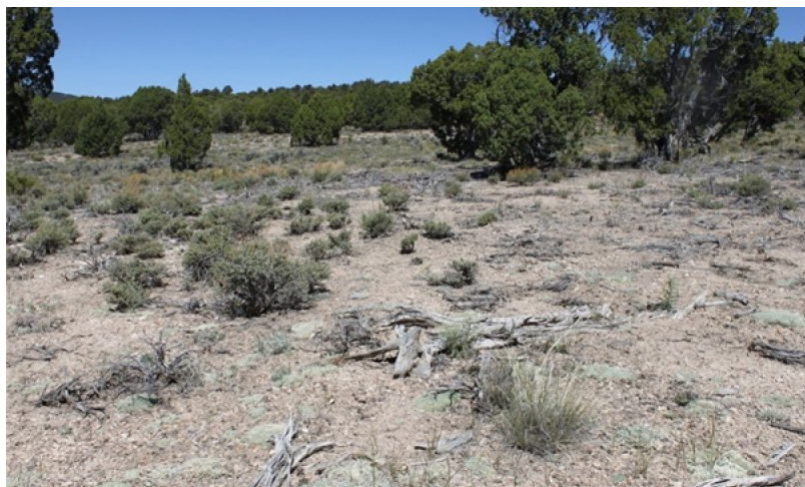
Figure 12. TStringham_6/2012

Utah juniper and/or singleleaf pinyon dominates the overstory and site resources. Trees are actively growing with noticeable leader growth. Trace amounts of bunchgrasses may be found under tree canopies with trace amounts of Sandberg bluegrass and forbs in the interspaces. Sagebrush is stressed and dying. Recruitment of sagebrush cohorts is minimal. Annual non-native species are present under tree canopies. Bare ground interspaces are large and connected.