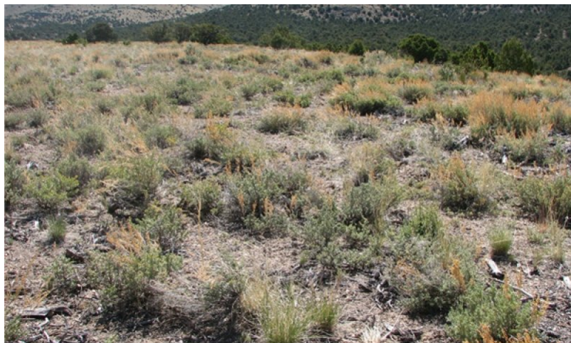
Figure 8. PNovak-Echenique 6/2012; MU296

This community is dominated by black sagebrush, bluebunch wheatgrass, needleandthread and Indian ricegrass. Forbs and other grasses make up smaller components. Utah juniper is described in the site concept and may or may not be present. Potential vegetation composition is approximately 60% grasses, 5% forbs and 35% shrubs and trees. Approximate ground cover (basal and canopy) is 15 to 25 percent.