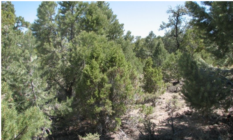
Figure 13. P.Novak-E; 6/14/2012; MU 296; Urmafot soil