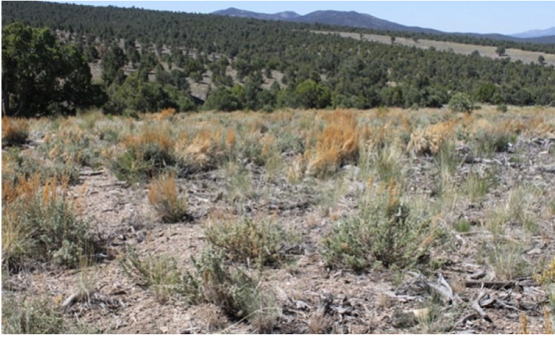
Figure 10. TStringham_6/2012

This community phase is characteristic of a post-disturbance, early seral community where annual non-native species are present. Sagebrush is present in trace amounts; perennial bunchgrasses dominate the site. Depending on fire severity or intensity of Aroga moth infestations, patches of intact sagebrush may remain. Rabbitbrush may be sprouting. Annual non-native species are stable or increasing within the community.