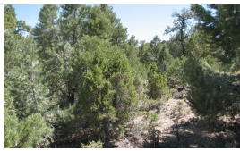
Community Phase (At Risk)