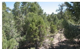
Community Phase (At Risk)

Time and lack of disturbance or management action allows for tree cover and density to further increase and trees to out-compete the herbaceous understory species for sunlight and water.