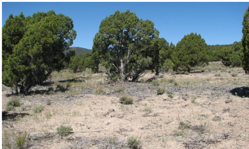
Figure 11. PNovak-Echenique, 6/12/2012; MU1260, Urmafot soil