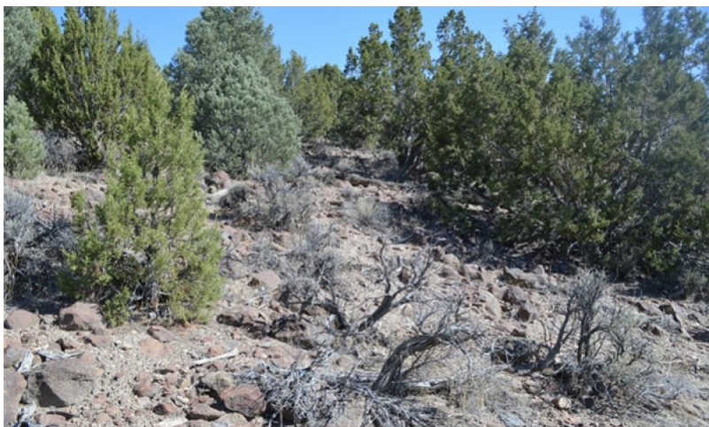
Figure 11. P. Novak-Echenique_9/2012

Utah juniper and/or singleleaf pinyon pine dominates the overstory and site resources. Trees are actively growing with noticeable leader growth. Trace amounts of bunchgrass may be found under tree canopies with or without trace amounts of Sandberg bluegrass and forbs in the interspaces. Sagebrush is stressed and dying. Annual non-native species are present under tree canopies. Bare ground interspaces are large and connected.