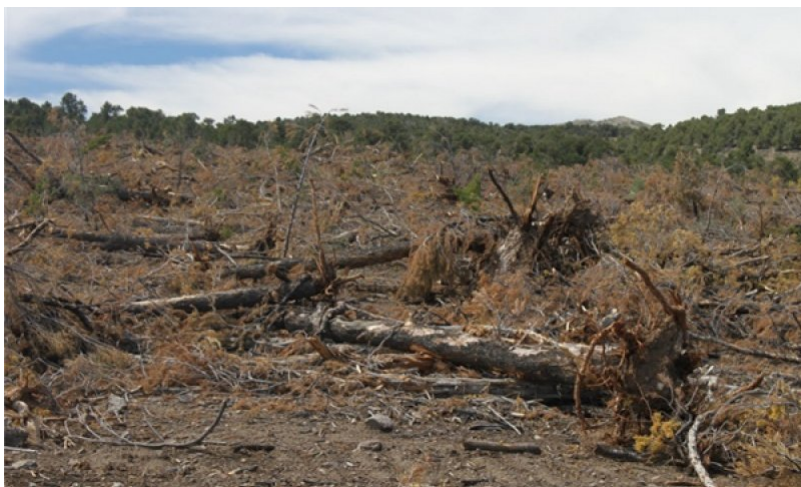
Figure 13. Tree Removal_P. Novak-Echenique_7/2012

Utah juniper trees and/or singleleaf pinyon pine dominates the site and tree leader growth is minimal; annual non-native species may be the dominant understory species and will typically be found under the tree canopies. Trace amounts of sagebrush may be present however dead skeletons will be more numerous than living sagebrush. Bunchgrasses may or may not be present. Sandberg bluegrass or mat forming forbs may be present in trace amounts. Bare ground interspaces are large and connected. Soil redistribution is evident.