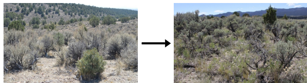
Community Phase (at risk)