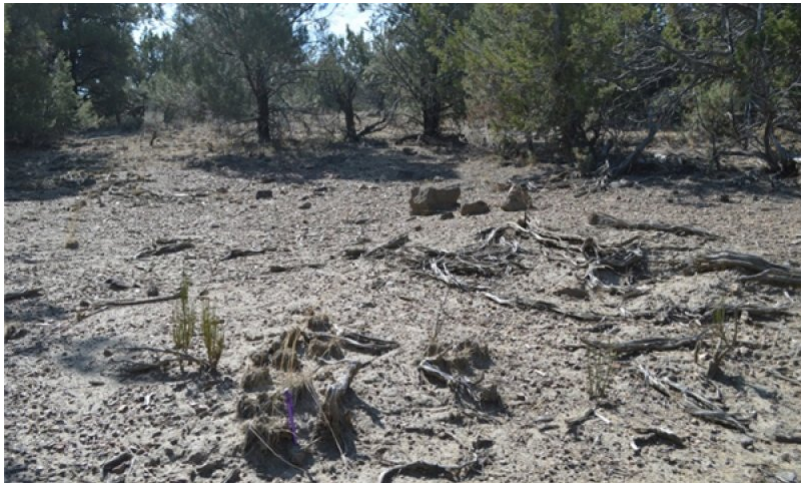
Figure 12. P. Novak-Echenique_9/2012