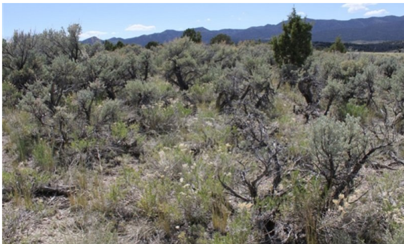
Figure 9. P. Novak-Echenique _6/2012 R028BY007NV

Wyoming big sagebrush, mountain big sagebrush, antelope bitterbrush, Thurber's needlegrass, bluebunch wheatgrass, needleandthread, Nevada bluegrass, muttongrass and Indian ricegrass dominate the site. Sandberg bluegrass and forbs make up smaller percentages by weight of the understory. Non-native annual species are present.