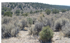
Community Phase (at risk)

Time and lack of disturbance such as fire allows for sagebrush to increase and become decadent. Chronic drought reduces fine fuels and leads to a reduced fire frequency allowing Wyoming big sagebrush and mountain big sagebrush to dominate the site. Inappropriate grazing management reduces the perennial bunchgrass understory; conversely Sandberg bluegrass may increase in the understory depending on grazing management. Excessive sheep grazing favors Sandberg bluegrass; however, where cattle and/or horses are the dominant grazers, cheatgrass often increases.