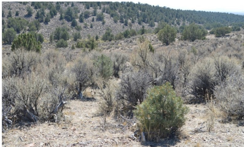
Figure 10. P. Novak-Echenique_6/2012 R028BY007NV

This community is at risk of crossing a threshold to another state. Sagebrush dominates the overstory and perennial bunchgrasses in the understory are reduced, either from competition with shrubs or from inappropriate grazing management, or from both. Rabbitbrush may be a significant component. Sandberg bluegrass may increase and become co-dominant with deep rooted bunchgrasses. Utah juniper and singleleaf pinyon may be present and without management will likely increase. Annual non-natives species may be stable or increasing due to lack of competition with perennial bunchgrasses. This site is susceptible to further degradation from grazing, drought, and fire.