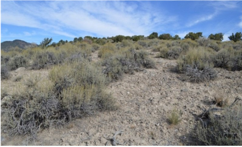
Figure 10. T.K. Stringham_9/2013