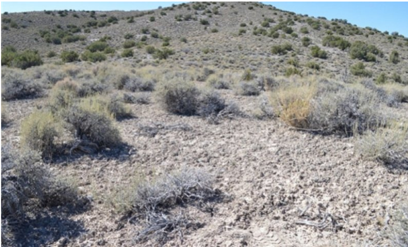
Figure 11. T.K. Stringham_9/2013

Black sagebrush dominates overstory while Sandberg’s bluegrass dominates the understory. Deep-rooted perennial bunchgrasses have significantly declined. Annual non-native species may be present. Bare ground and soil redistribution may be increasing. If present on the site, Utah juniper is increasing. The community phase may be at risk of transitioning into a Tree State or Annual State