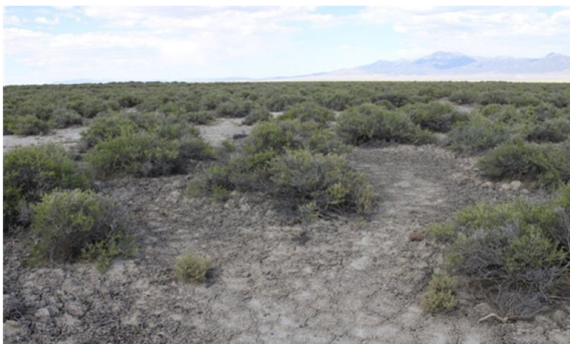
Figure 11. Sodic Flat 5-8" (R028BY020NV) T.Stringham June 2012