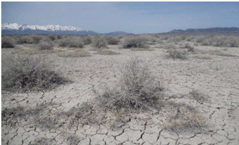
Figure 10. Sodic Flat 5-8" (R028BY020NV) T.Stringham April 2013

Black greasewood dominates the overstory and perennial bunchgrasses in the understory are reduced, either from competition with shrubs or from inappropriate grazing, or from both. Rabbitbrush may be a significant component. Annual non-native species are stable or increasing. This community is at risk of crossing a threshold to State 3.0 (grazing or fire).