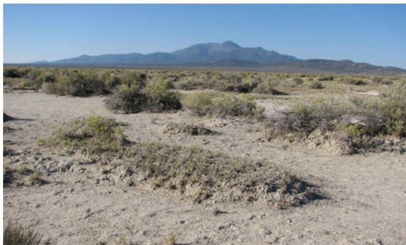
Figure 9. Sodic Flat 5-8" (R028BY020NV) T.Stringham September 2013

Black greasewood and shadscale increase in the absence of disturbance. Decadent shrubs dominate the overstory and deep-rooted perennial bunchgrasses in the understory are reduced either from competition with shrubs, herbivory, drought or combinations of these.