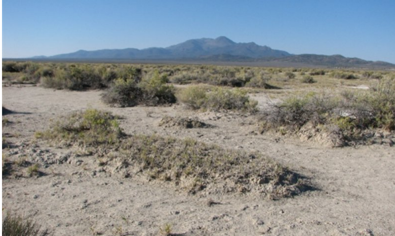
Figure 9. Sodic Flat 5-8" (R028BY020NV) T.Stringham September 2013

Black greasewood and shadscale increase in the absence of disturbance. Decadent shrubs dominate the overstory and deep-rooted perennial bunchgrasses in the understory are reduced either from competition with shrubs, herbivory, drought or combinations of these.