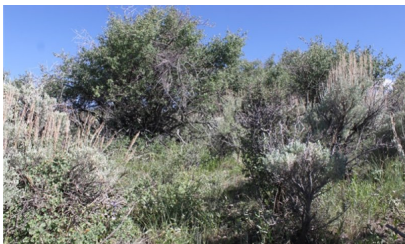
Figure 9. Fractured Stony Loam 14" (R028BY026NV) T. Stringham June 2012