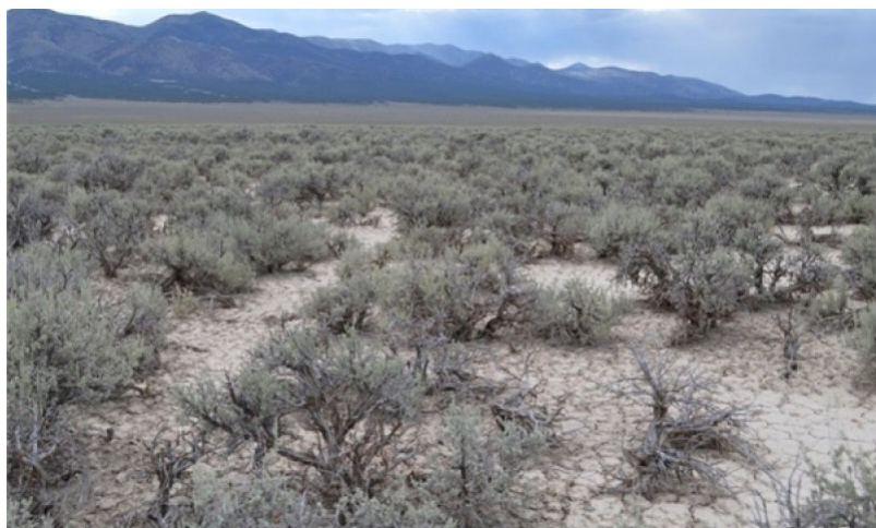
Figure 10. Fractured Stony Loam 14+ (R028BY026NV) T.Stringham July 2013

This site is at risk of transitioning to another state. Mountain big sagebrush, possibly decadent, dominates overstory and rabbitbrush may be a significant component. Deep-rooted perennial bunchgrasses may be present in trace amounts or absent from the community. Utah juniper may be present or increasing. Annual non-native species are present to increasing. Understory may be sparse, with bare ground increasing. Utah juniper or singleleaf pinyon may be present as a result of encroachment from neighboring sites and lack of disturbance.