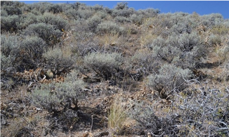
Figure 8. Loamy 12-16” (R028BY030NV) T. Stringham September 2012

This community phase is characteristic of a post-disturbance, early to mid-seral community phase. Bluebunch wheatgrass, Thurber’s needlegrass and other perennial grasses dominate. Mountain big sagebrush cover and production is greatly reduced.