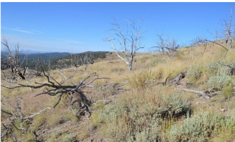
Figure 9. T. Stringham, July 2014, NV780, MU851 Lithic Calcixeroll