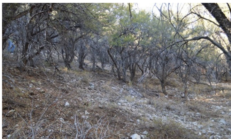
Figure 8. T. Stringham 9/2012, NV776, MU 451, Haunchee soil series

Mahogany density will increase in the absence of disturbance. Shrubs and deep-rooted perennial bunchgrasses will be shaded out by the dense mahogany. Muttongrass is more shade tolerant, however, and will still be found in the understory. Mahogany in dense stands will lose lower branches due to shading and/or herbivory, resulting in a more tree-like appearance. Scattered pinyon and juniper trees may be present and increasing on the site, however the mahogany and shrub understory is intact and is dominating site resources (Miller et al 2008).