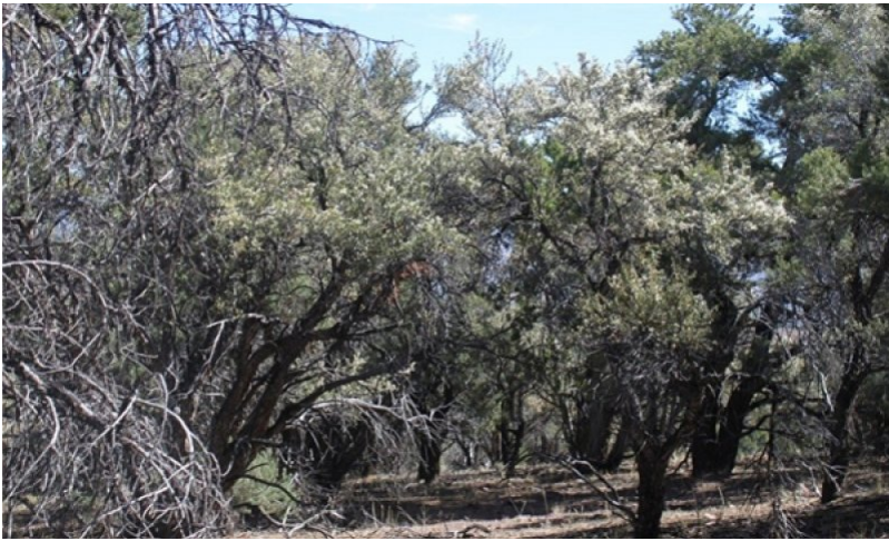
Figure 12. T. Stringham July 2012, NV780 MU770, Lithic Argicryoll

Singleleaf pinyon, Utah juniper, and mountain mahogany co-dominate this phase. The understory of shrubs and grasses is nearly intact but shows signs of thinning (Miller et al 2008). Mountain big sagebrush and snowberry are starting to show signs of increased competition from tree canopy and are decreasing in the understory. Muttongrass increases with shading and may be the dominant bunchgrass in the understory. Annual non-native species are present and may be increasing.