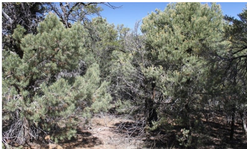
Figure 11. T. Stringham July 2012, NV789 MU 770, Lithic Argicryoll