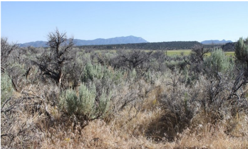
Figure 10. P. Novak-Echenique_6/2012

Wyoming big sagebrush overstory with annual non-native species understory. Trace amounts of desirable bunchgrasses may be present.