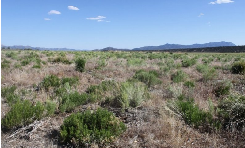
Figure 9. P. Novak-Echenique_6/2012

Annual non-native plants such as cheatgrass or tansy mustard dominate the site. Rabbitbrush may or may not be present.