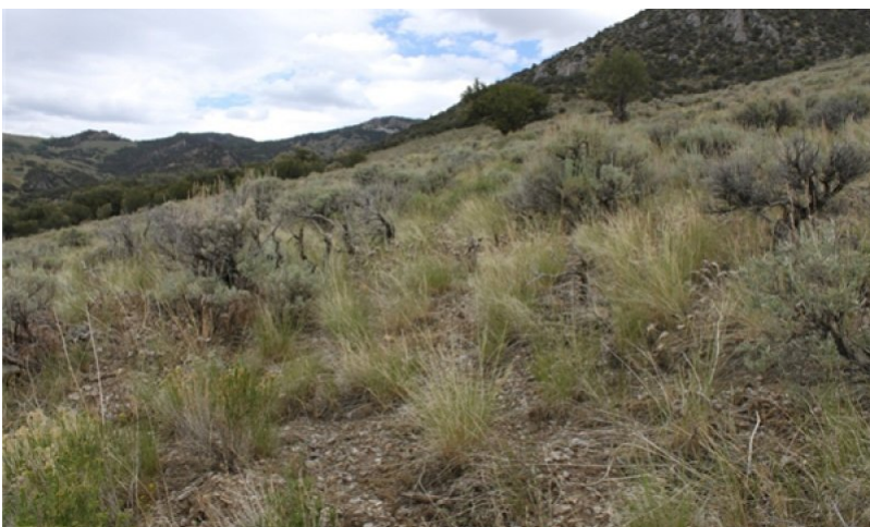
Figure 10. Mountain Loam 16+\" (R028BY070NV) T. Stringham July 2012

Mountain big sagebrush is reduced. Mountain snowberry, rabbitbrush, Utah serviceberry and antelope bitterbrush may be sprouting or may dominate the overstory. Perennial bunchgrasses in the understory increase and dominate. Annual non-native species are stable to increasing.