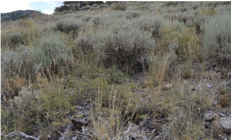
Figure 9. Mountain Loam 16\" (R028BY070NV) T. Stringham July 2012

The plant community consists of mountain big sagebrush as the major overstory shrub, with snowberry also common on this site. Bluebunch wheatgrass is the dominant understory species. Annual non-native species are now present in this community. Cheatgrass is the species most likely to invade.