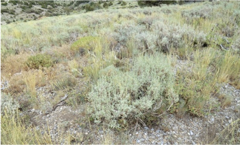
Figure 8. Mountain Loam 16+\" (R028BY070NV) Community Phase 2.1 P.Novak-Echenique Aug 2013