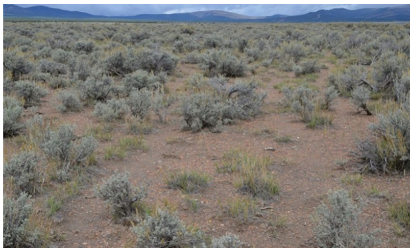
Figure 9. P. Novak-Echenique_9/2013

Wyoming big sagebrush and seeded wheatgrass species co-dominate. Annual non-native species stable to increasing.