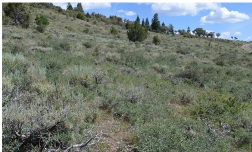
Figure 9. Calcareous Loam 16+" (R028BY085NV) T. Stringham July 2013

Mountain big sagebrush increases in the absence of disturbance or with grazing management that favors shrubs. Decadent sagebrush dominates the overstory and the deep-rooted perennial bunchgrasses in the understory are reduced either from competition with shrubs or from grazing management.