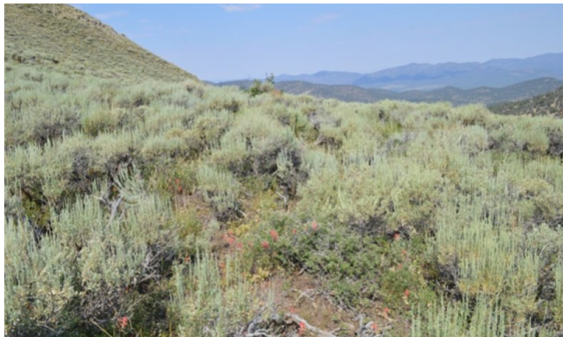
Figure 8. Calcareous Loam 16+" (R028BY085NV) T. Stringham July 2013