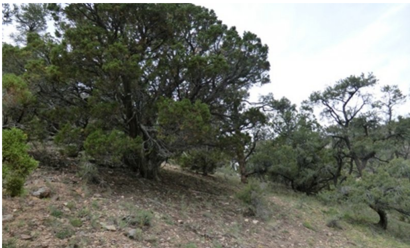
Figure 9. Calcareous Loam 14-16" (R028BY088NV) T. Stringham June 2013

Utah juniper and singleleaf pinyon dominate the overstory and site resources. Trees are actively growing with noticeable leader growth. The shrub and grass understory is reduced. Sagebrush is stressed and dying. Trace amounts of deep-rooted bunchgrass may be found under tree canopies with Sandberg bluegrass and forbs in the interspaces. Annual non-native species are present under tree canopies. Bare ground areas are large and connected.