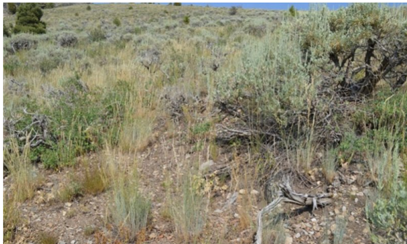
Figure 7. Calcareous Loam 14-16" (R028BY088NV) T. Stringham July 2013

Mountain big sagebrush and bluebunch wheatgrass dominate the site. Thurber's needlegrass is a sub-dominant species on this site. Basin wildrye, bluegrasses, and antelope bitterbrush are also common. Potential vegetative composition is approximately 60% grasses, 10% forbs and 30% shrubs and trees. Approximate ground cover (basal and canopy) is 25 to 35 percent.