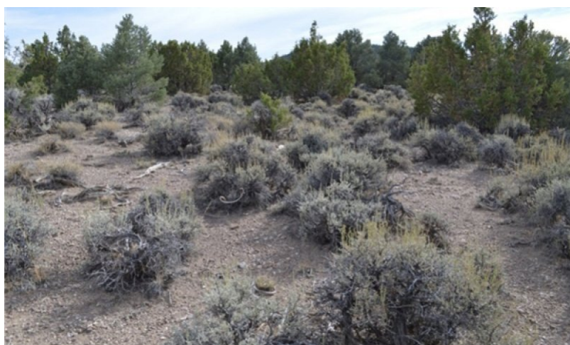
Figure 9. T.K. Stringham_9/2013