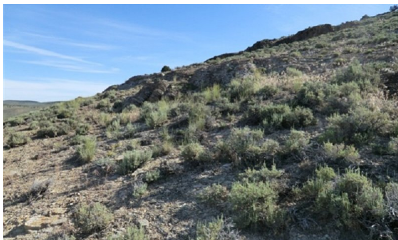
Figure 9. TStringham_6/2013