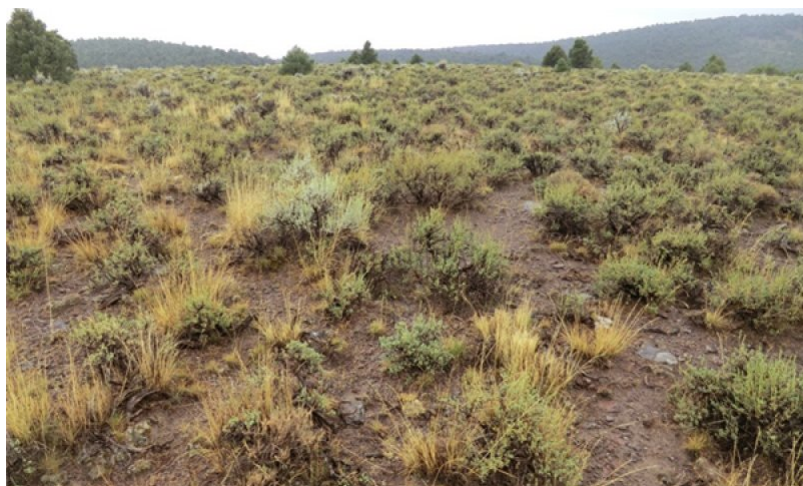
Figure 7. P.Novak-Echenique 9_12_2013; NV 780; SMU 760 - Upatad

This community is dominated by black sagebrush, bluebunch wheatgrass, Thurber's needlegrass, muttongrass, Canby's bluegrass and Indian ricegrass. Forbs and other grasses make up smaller components. Utah juniper is described in the site concept and may or may not be present. Potential vegetative composition is approximately 60% grasses, 5% forbs and 35% shrubs and trees. Approximate ground cover (basal and canopy) is 15 to 25 percent.