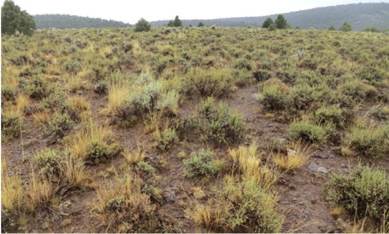
Figure 7. P.Novak-Echenique 9_12_2013; NV 780; SMU 760 - Upatad

This community is dominated by black sagebrush, bluebunch wheatgrass, Thurber’s needlegrass, muttongrass, Canby’s bluegrass and Indian ricegrass. Forbs and other grasses make up smaller components. Utah juniper is described in the site concept and may or may not be present. Potential vegetative composition is approximately 60% grasses, 5% forbs and 35% shrubs and trees. Approximate ground cover (basal and canopy) is 15 to 25 percent.