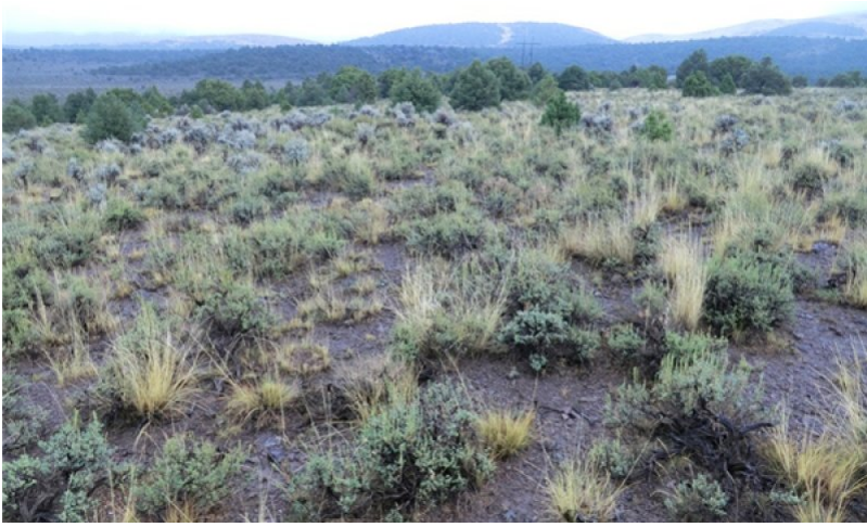
Figure 9. P.Novak-Echenique 9_11_2013; NV780, SMU760-Upatad

Black sagebrush dominates the overstory and perennial bunchgrasses in the understory are reduced, either from competition with shrubs or from inappropriate grazing, or from both. Rabbitbrush may be a significant component. Sandberg bluegrass may increase and become co-dominant with deep rooted bunchgrasses. Utah juniper may be present and without management will likely increase. Annual non-natives species may be stable or increasing due to lack of competition with perennial bunchgrasses. This site is susceptible to further degradation from grazing, drought, and fire. This community is at risk of crossing a threshold to either State 3.0 (grazing or fire) or State 4.0 (fire).