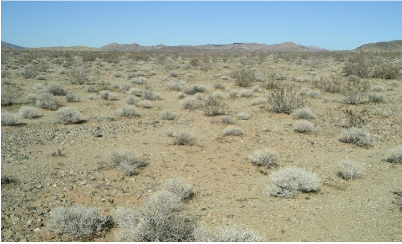
Figure 4. Community Phase 2.1

The reference community for this ecological site is almost exclusively composed of low-growing creosote bush ( Larrea tridentata ) and burrobush ( Ambrosia dumosa ), with lesser dominants including white ratany and littleleaf ratany ( Krameria grayi and K. erecta ), Mojave yucca ( Yucca schidigra ), chollas ( Cylindropuntia spp.), cacti ( Echinocereus spp. and Ferocactus cylindraceus ), ephedras ( Ephedra spp.) and a sparse understory composed primarily of the annual forbs, curvenut combseed ( Pectocarya recurvata ), pincushion flower ( Chaenactis fremontii ) and desert calico ( Loeseliastrum matthewsii ). The community is characterized by its low production, with 3-4 foot-tall creosote bush ( Larrea tridentata ), but high abundance of burrobush.