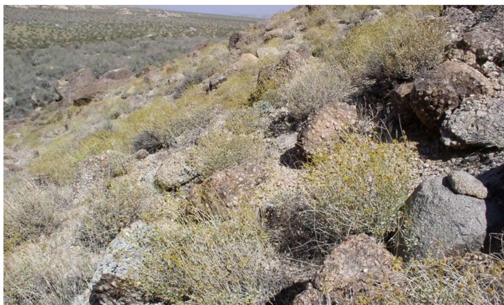
Figure 5. Community Phase 2.1

This community phase is dominated by brittlebush and creosote bush. Secondary shrubs are present at low levels, and include burrobush ( Ambrosia dumosa ), waterjacket ( Lycium andersonii ), jojoba ( Simmondsia chinensis ), Parish's goldeneye ( Viguiera parishii ), Mojave yucca ( Yucca schidigera ), white ratany ( Krameria grayii ), and California barrel cactus ( Ferocactus cylindraceus ). The perennial bunchgrass big galleta ( Pleuraphis rigida ) may be sparsely present. Native subshrubs and perennial forbs include brownplume wirelettuce ( Stephanomeria pauciflora ), Mojave aster ( Xylorhiza tortifolia ), desert globemallow ( Sphaeralcea ambigua ) and desert trumpet ( Eriogonum inflatum ). Annuals species, though present, have relatively low abundance in this ecological site. High surface fragment cover limits the microsites available for annuals, and the canopy of the short-lived brittlebush does not provide suitable habitat for annuals (Muller 1953). Though not abundant, winter annuals are seasonally present, and commonly include desert poppy ( Eschscholzia glyptosperma ), brittle spineflower ( Chorizanthe brevicornu ), pincushion flower ( Chaenactis fremontii ), lacy phacelia ( Phacelia tenacetifolia ), sand fringe pod