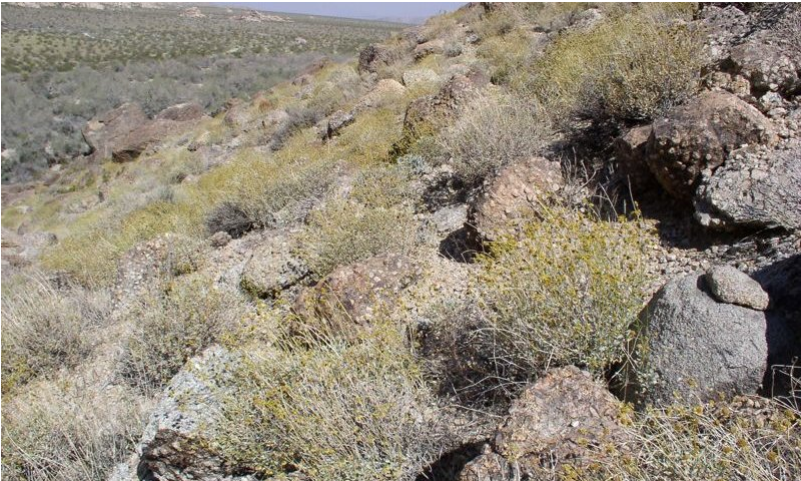
Figure 5. Community Phase 2.1

State 2 represents the current range of variability for this site. Non-native annuals, including red brome ( Bromus rubens ) and red-stem stork's bill ( Erodium cicutarium ) are naturalized in this plant community. Their abundance varies with precipitation, but they are at least sparsely present (as current year's growth or present in the soil seedbank).