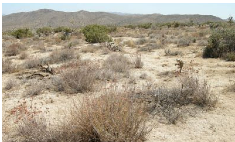
Figure 10. Community Phase 3.1

This community represents the post-fire potential plant community for this site. This community is dominated by eastern Mojave buckwheat, with California juniper dispersed throughout the site in areas receiving additional runoff. Important secondary shrubs include Mojave yucca, Nevada ephedra, and Cooper's goldenbush. The perennial bunchgrass desert needlegrass is typically sparsely present, and big galleta may be present. Subshrubs are an important component of the plant community, and include shrubby deervetch, wishbone bush and desert globemallow. Winter annuals may be seasonally abundant, generally at higher levels than in the Reference State. The non-native annual grasses red brome and cheatgrass are present, as is the non-native annual forb red-stem stork's bill.