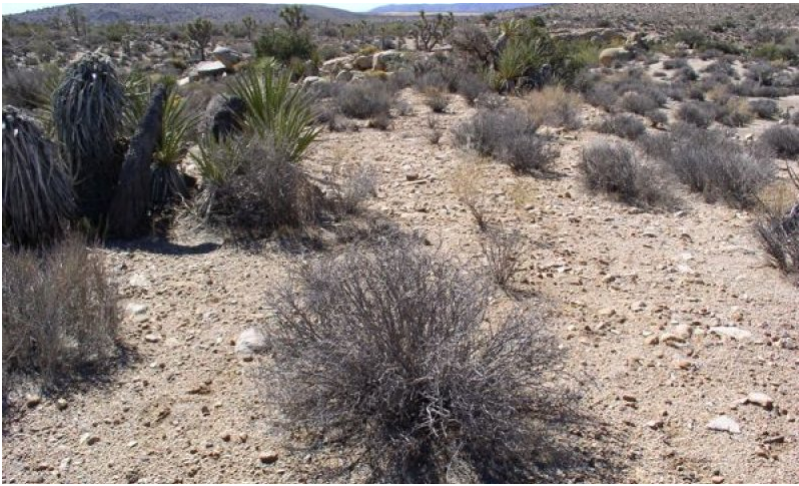
Figure 7. Community Phase 2.1