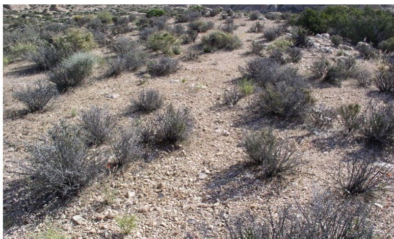
Figure 5. Community Phase 2.1