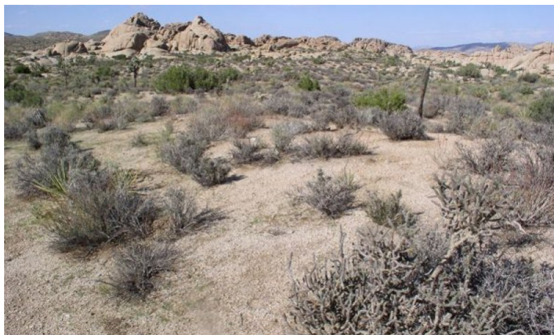
Figure 6. Community Phase 2.1