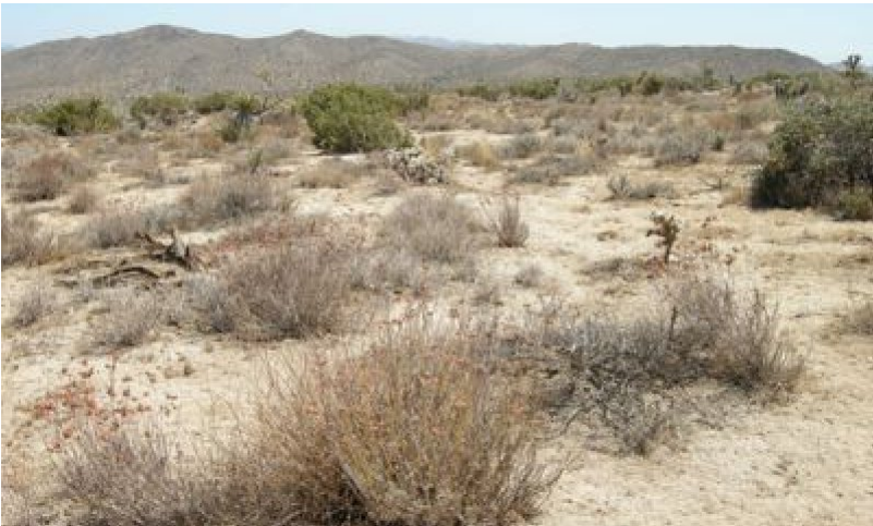
Figure 10. Community Phase 3.1

This state is characterized by the loss of blackbrush from the plant community due to severe or recurrent fire.