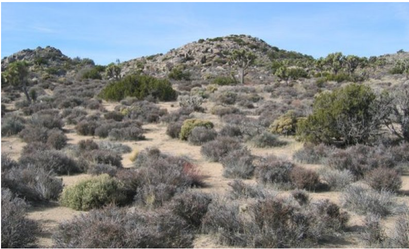
Figure 8. Community Phase 2.1

The current potential plant community is dominated by blackbrush, with California juniper dispersed throughout the site in areas receiving additional run-on. Important secondary shrubs include Acton's encelia ( Encelia actonii ), Nevada jointfir ( Ephedra nevadensis ), Mojave yucca ( Yucca schidigera ) and eastern Mojave buckwheat. A relatively high diversity of minor shrubs may also be present, and are often found near areas of additional run-on, such as at the base of rock outcrops, or in concave areas. Areas of run-on may support desert almond ( Prunus fasciculata ) and catclaw acacia ( Acacia gregii ). Subshrubs are an important component of the vegetation community, and include shrubby deervetch ( Lotus rigidus ), desert globemallow ( Sphaeralcea ambigua ), and whishbone bush ( Mirabilis laevis var. villosa ). The perennial bunchgrass desert needlegrass ( Achnatherum speciosum ) is usually sparsely present. Native winter annuals are seasonally present, as are the non-native annual grasses red brome and cheatgrass. Biological soil crusts (BSC) are often associated with the grussy granite (granite that is granulated but not decomposed) typical of soil surfaces on this ecological site. These crusts are important for improving soil stability, infiltration, and nutrient cycling on these shallow soils (Belnap et al. 2001). Biological soil crusts form slowly, and are very sensitive to physical disturbance (such as from trampling or off-road vehicle disturbance).