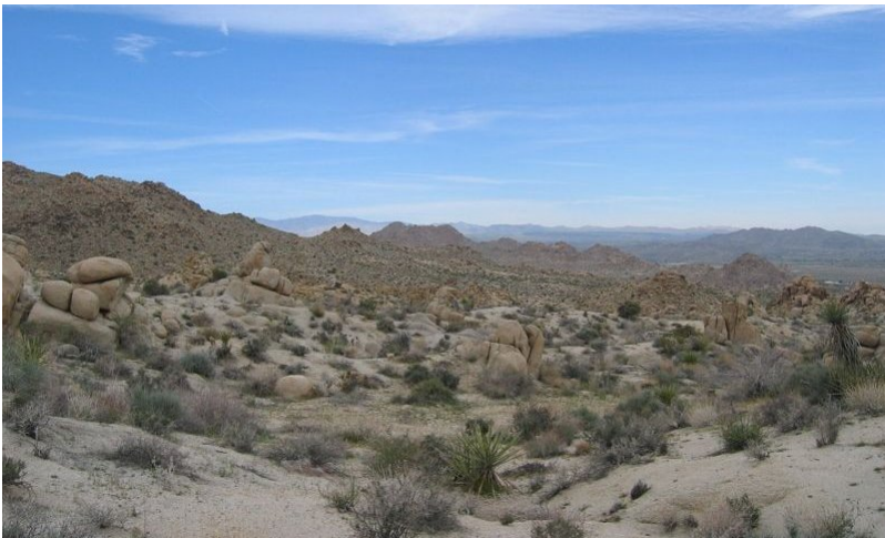
Figure 4. Community Phase 2.1