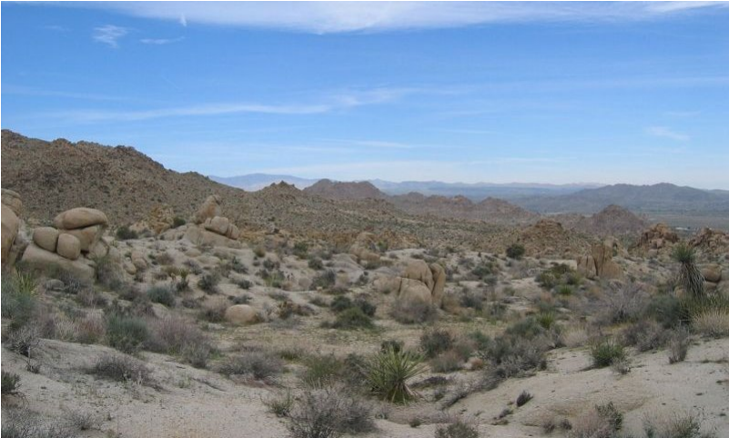
Figure 4. Community Phase 2.1

State 2 represents the current range of variability for this site. Non-native annuals, including red brome and red-stem stork's bill ( Erodium cicutarium ) are naturalized in this plant community. Their abundance varies with precipitation, but they are at least sparsely present (as current year's growth or present in the soil seedbank).