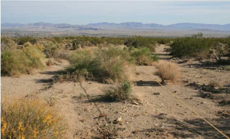
Figure 4. CC1