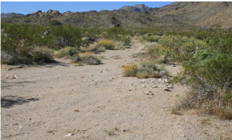
Figure 5. CC2