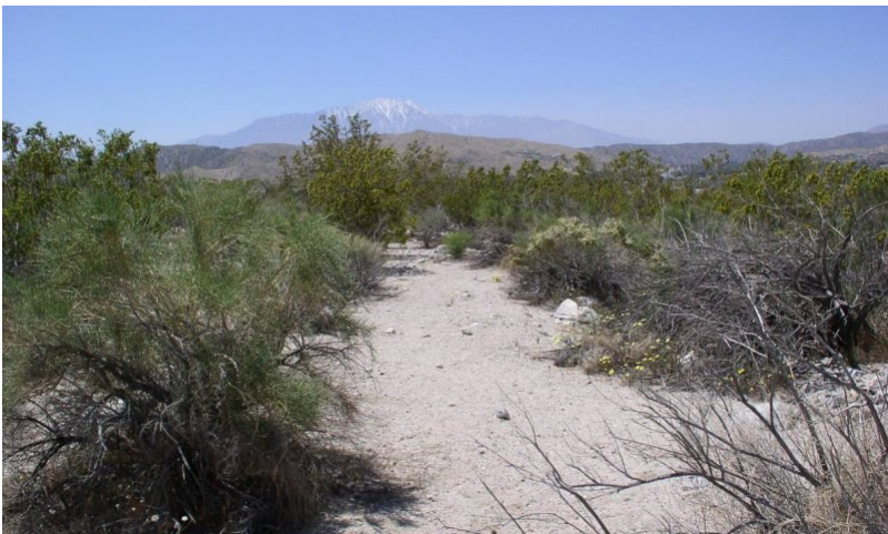
Figure 6. CC2, high production

This community phase is dependent upon unimpaired hydrologic function and average to above average precipitation. At any given point along the stream the following community components are generally present. The