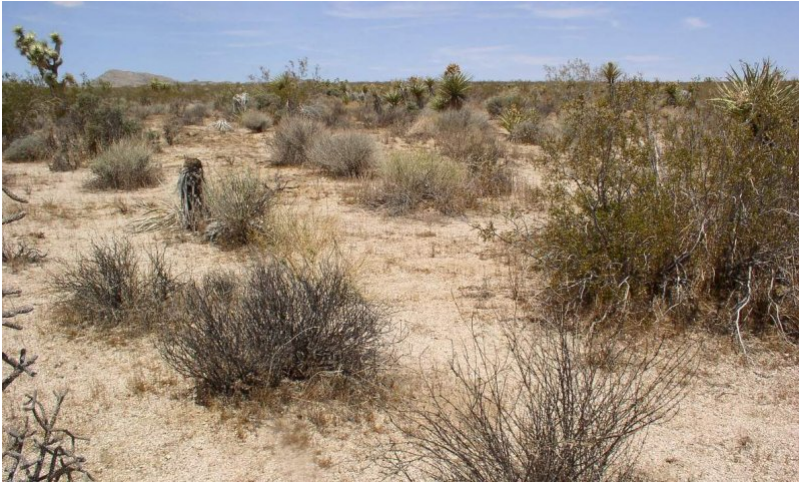
Figure 5. Community Phase 2.1