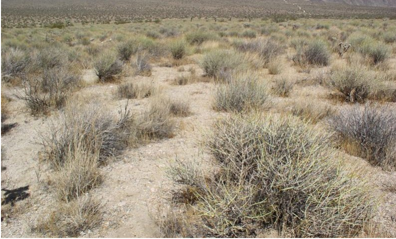
Figure 7. Community Phase 2.3