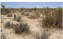
Current potential plant community