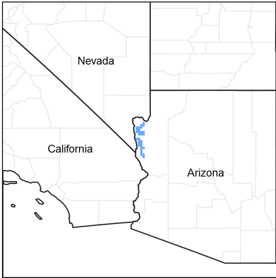
Figure 1. Mapped extent

Provisional. A provisional ecological site description has undergone quality control and quality assurance review. It contains a working state and transition model and enough information to identify the ecological site.